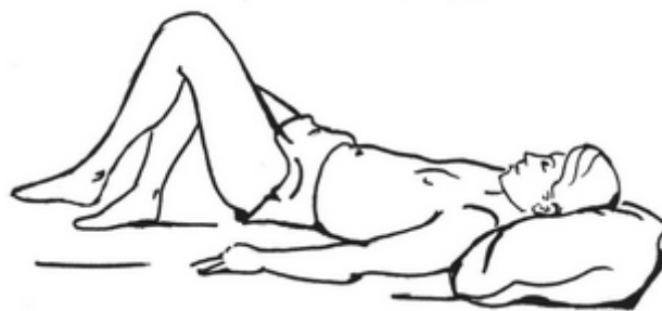
More challenging, first bridge up, either the half bridge as pictured, or a full bridge. Then lift one leg up.