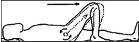
Self-traction exercise for the SI.