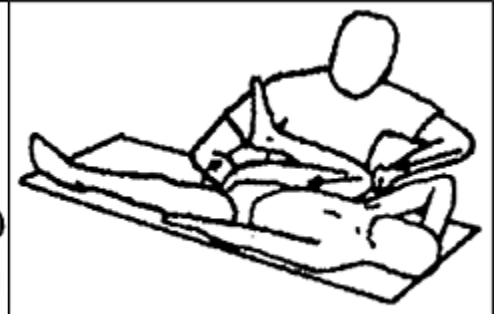
Muscle energy-style corrective procedure for the SI joint.

reproduced a whole series of pictures, showing different positions in which to do the same basic exercise. The basic routine is to have the patient bring the leg up to the chest, grasp the leg with both arms, and push outward with the leg against resistance. DonTigny recommends pushing outward hard for five to 10 seconds, then alternating legs, doing each side three to five times. Note that this can be done supine, sitting, standing using a chair, or in a doorway.